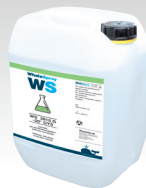
Cooling liquid 5 L ref. 062511