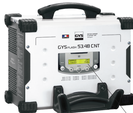
Intuitive interface available in 22 languages